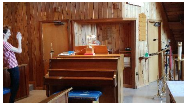
Figure 2 Alex doing the "clap sync" for the final hymn