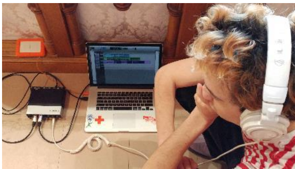
Figure 5 My view while the psalm is being recorded (looking down) and yes, I didn't change all the panels in the altar.

When we are recording the spoken parts of the service, we use the lectern mic and the wireless mic so the computer and the camera are both on the table at the front.