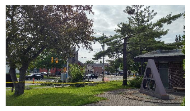
On Saturday morning (May 28), volunteers came to the church and cleaned up some of the branches which came down.

The storm that ripped through Ottawa late Saturday afternoon has disrupted many of our lives and also affected the church. The church building was undamaged but the large pine on Fisher in front of Bishop Reed Hall lost its top and damaged the small tree in front of it. The church lost power during the storm but regained it on Tuesday afternoon.