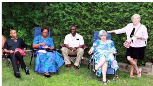
Relaxing while eating