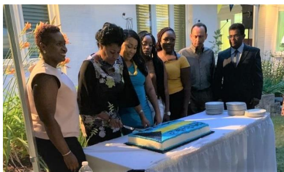
Cutting the cake