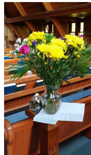
Letter and flowers on display at Sunday service

This is a great time to explore jobs that you have been thinking about but were not ready to get tied into a regular schedule. If you