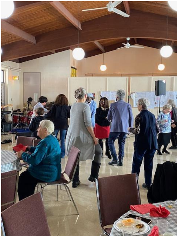
Dancing with the Reggae Band