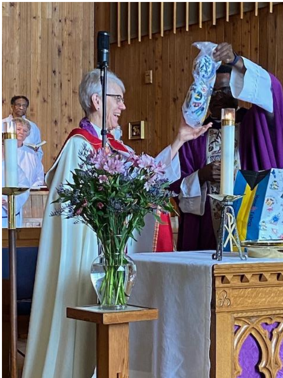
Primate receiving Bahamas design travel pillow