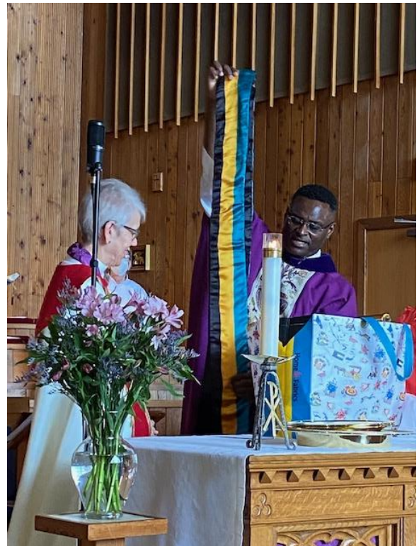
Primate receiving Bahamas stole