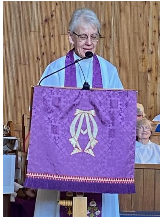
The Primate preaching the sermon

If you have anything you would like to see in next week's newsletter, please email the church at stmarks@stmarksottawa.ca