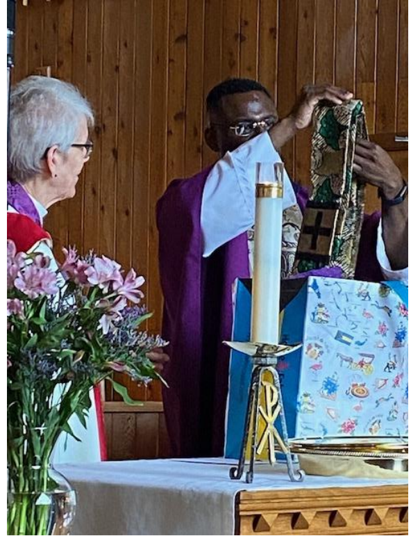
Primate receiving Black History Month Stole