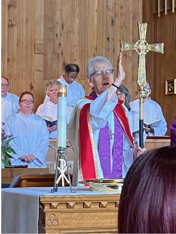
The Primate giving the Blessing