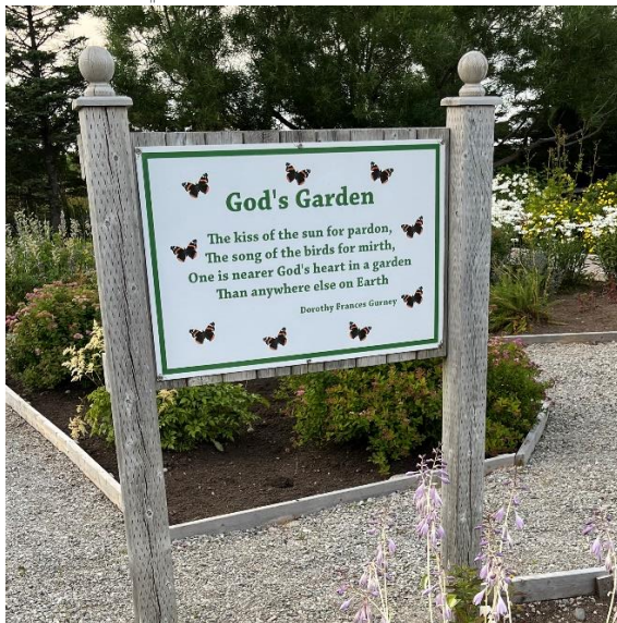
St. Mary's botanical garden. CowHead, Newfoundland.

The August to October booklet has arrived and is available in the office. The cost of the booklet is $3.