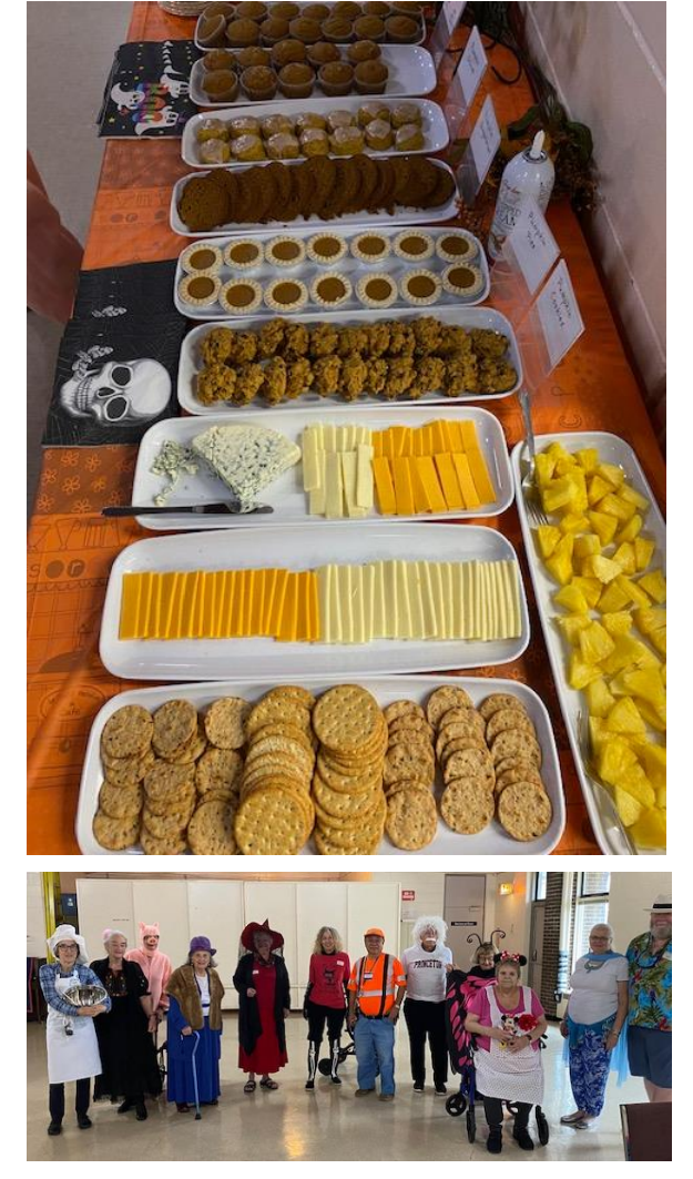
Next week, November 2, join us for coffee and conversation – and of course, tasty treats. All are welcome.

Thursday's CCC was lots of fun with the majority of the attendees wearing Halloween costumes. We enjoyed lots of pumpkin baked goods and there were prizes for best costumes.