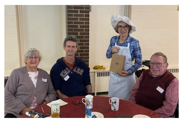
Second Prize – The Butterfly