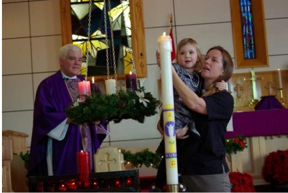
"The Light shines in darkness and the darkness has not overcome it." John 1:5