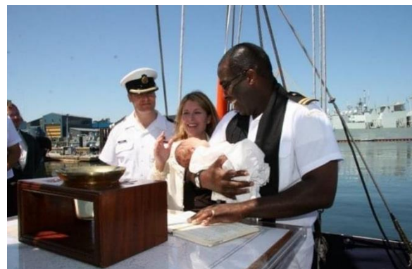
The baptism of a chaplain's child on board ship – using the ship's bell as a font.

It was a morning of enlightenment and one that left those present with a gratitude for their service as spiritual leaders and comrades in the service of our country.