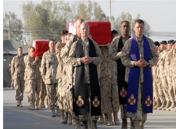
Casualties being brought home,