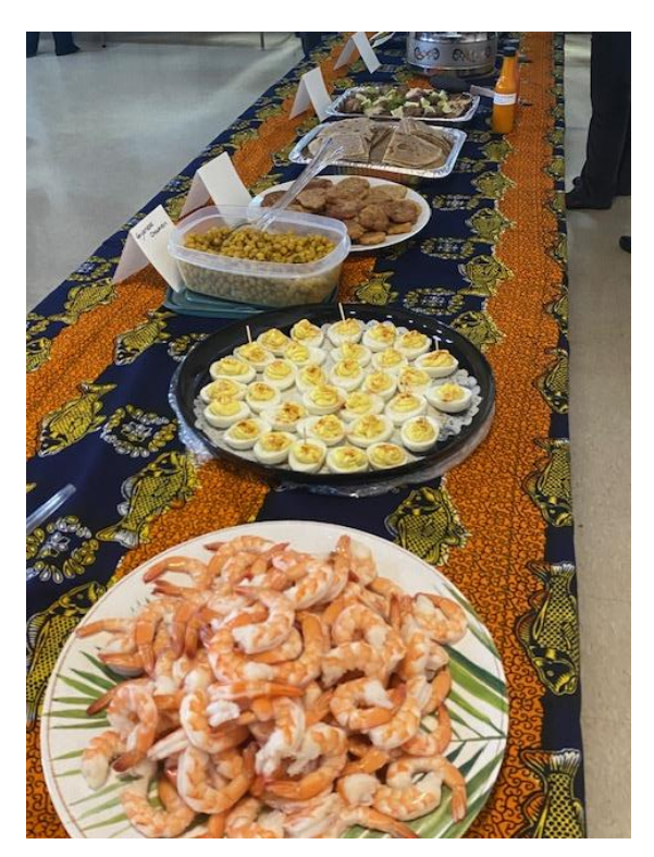
Coffee, Company & Conversation