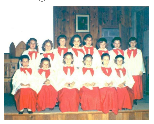
1958 Girls Choir