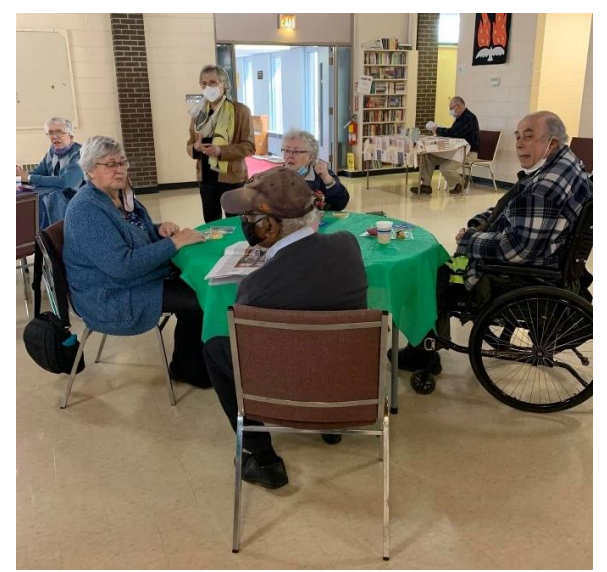
On April 21, 2022 Coffee, Company & Conversation resumed after the pandemic. This is a picture from that first post-pandemic CCC.