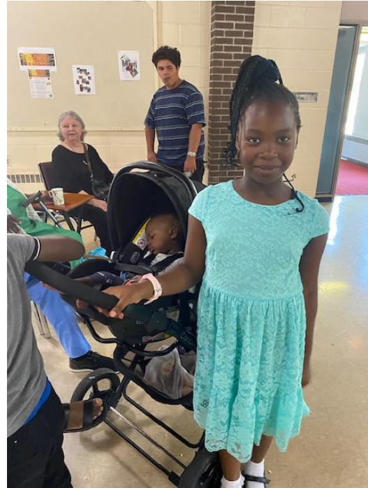
Fellowship after the 10 am service.